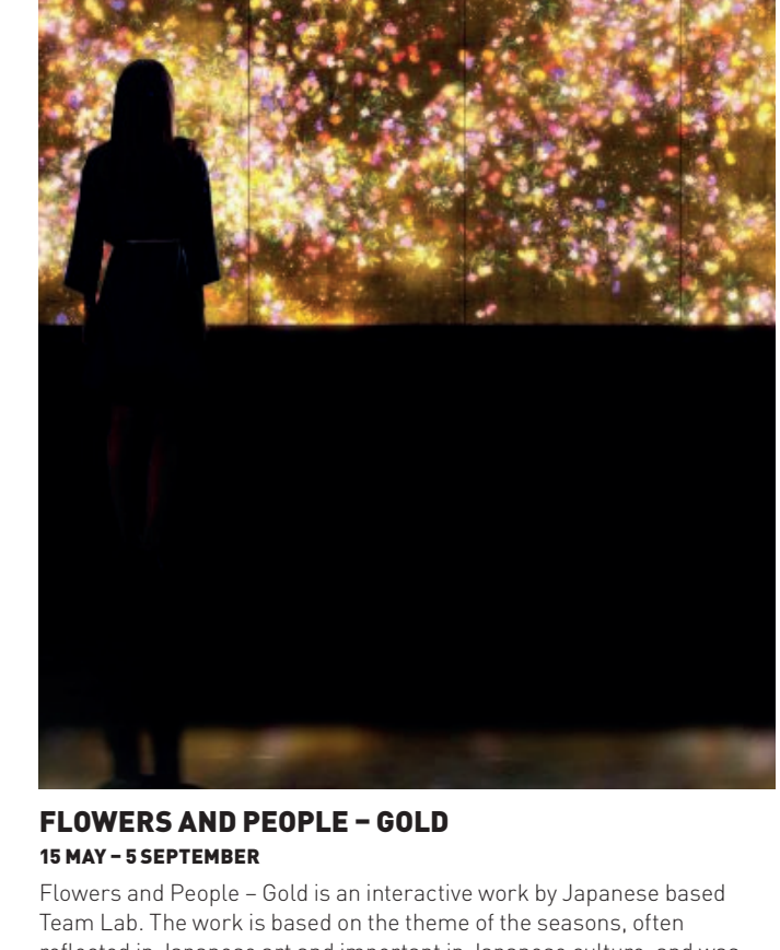
Proudly supported by Lotteries Tuia – Encounters 250

reflected in Japanese art and important in Japanese culture, and was inspired by a visit to Kunisaki Peninsula in the spring, a time when cherry blossoms were in abundance around the mountains.