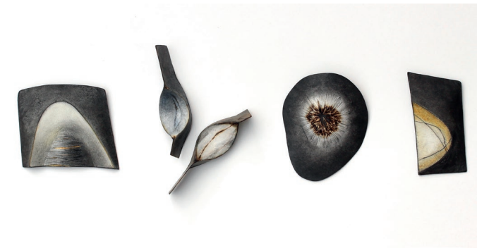
Image credit: Jo Torr, Te Hono Wai – Where Waters Meet (install view) 2020

The exhibition titled Te Hono Wai – Where Waters Meet is a metaphor for peoples meeting and cultural exchange. Waters meet at an estuary with freshwater meeting saltwater, one culture interacting with another through an ebb and flow of understanding and misunderstanding, ultimately affecting change on both parties. This exhibition highlights encounters between Māori and European in the early 19 th century both here in the Bay of Islands, and in England.